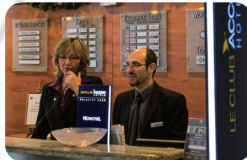
Hotel Help Desk