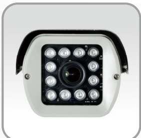
24 MIL 12 pcs IR LED